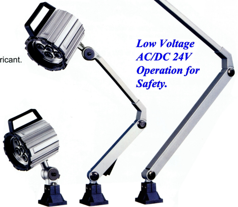
• FP-55S-L • FP-55M-L • FP-55L-L