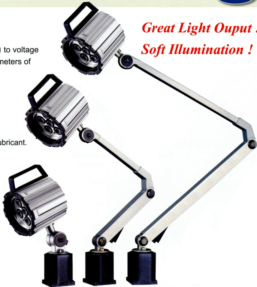
• FP-55NTS-L • FP-55NTM-L • FP-55NTL-L

Great Light Output ! Soft Illumination !